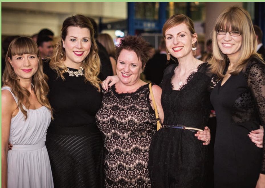
Members of our team celebrating at a 'Love Brum' Charity Gala.