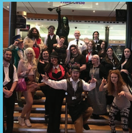
Staff dress up as their favourite theatre character for Love Theatre Day.

Following the bereavement of an immediate family member 5 days paid leave plus time to attend the funeral. Time off with pay will also normally be granted to allow attendance at funerals of extended family or a colleague.