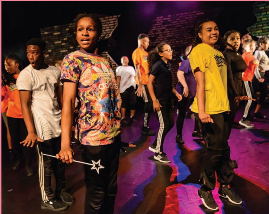
Groove on Down the Road – featuring young people from our spring Hippodrome Education Network.

Our fundraising efforts, together with all surpluses (from our share of box office income and our bars, event hire and catering) are reinvested back to our charitable Hippodrome Projects.